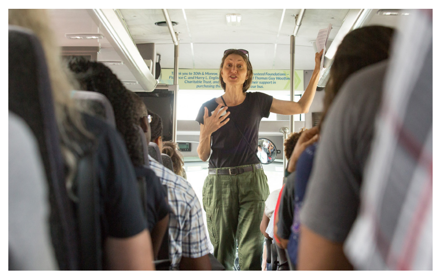
Bus and walking tours were held to highlight neighborhood assets.

Once the master plan was complete, Casey hired a real estate partner, Clark Property Consulting (Clark), and a law firm specializing in community development, Reno & Cavanaugh, to help execute a redevelopment process aligned with the recommendations community members had developed. The Foundation and Clark designed and issued a request for proposals in 2013 to identify a developer that could restore a subset of the vacant houses Casey had purchased and sell them to an economically diverse set of buyers. Specifically, the Foundation wanted to attract three types of buyers: people earning less than 80% of the area median income — which at the time was $53,051 for a single-person household in metro Atlanta<sup>16</sup> — those earning less than 80%-120% of the area median income and buyers without income restrictions. By doing so, it