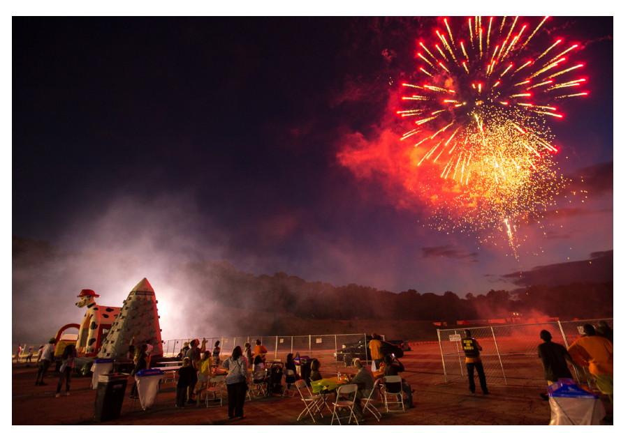
The Pittsburgh Rise festival, which featured outdoor activities and live entertainment, was held in May 2016 to celebrate the neighborhood.