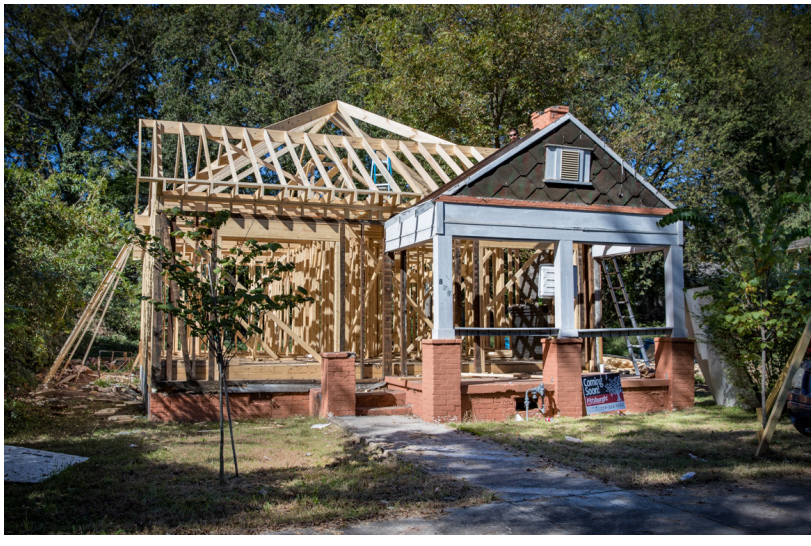
Redevelopment efforts in progress on Beryl Street.

them to Atlanta Land Trust to ensure permanent affordability.