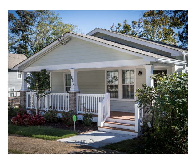
A completed Casey home on Welch Street.

use a forgivable lien to cover any subsidies and loosen income restrictions after a few years or when the homeowner sells the house. This helps build individual wealth for the first homeowner, who is able to sell at market rate, but does nothing to help preserve long-term affordability. Thus, affordable housing service providers must continue filling a leaking bucket of affordability in the community by investing in additional subsidies and developing more affordable homes.