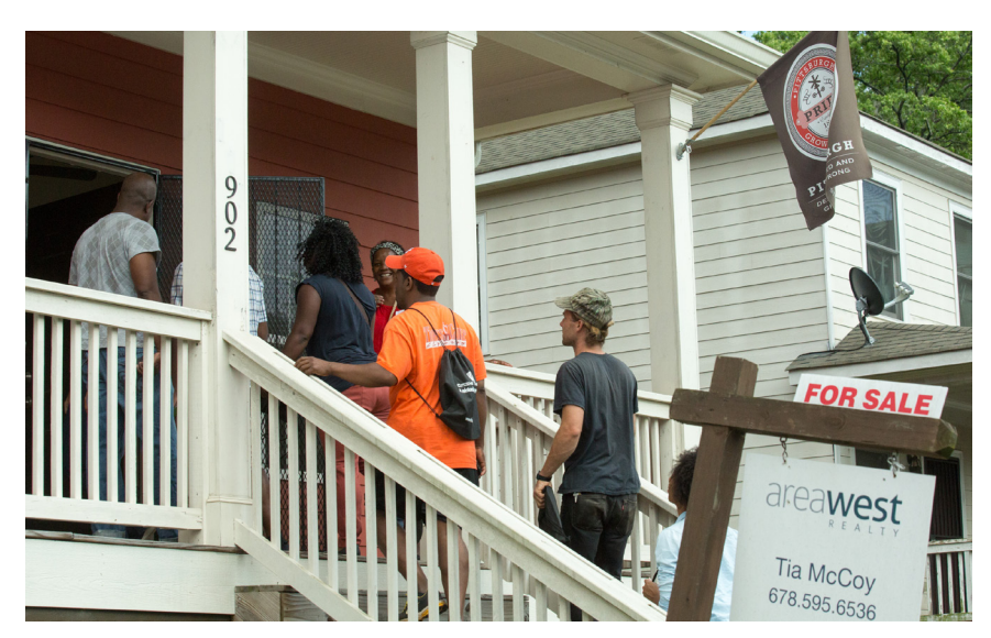
Prospective homebuyers were able to tour redeveloped houses and interact with real estate partners.

The houses were initially priced from $75,000 to $105,000. Though market demand was slow at first, causing some houses to sit for six months or more, all 19 homes from the first two phases had been sold by early 2018. The process took more than $3.5 million in combined investment, as well as significant time and human resources.