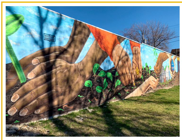
Seeds of Hope garden mural on Milwaukee's Southside.

safety still heavily rely on policing and punitive measures, with investments primarily made in law enforcement and justice systems. These approaches not only have failed to curb violence but also have created additional problems, including mass incarceration and the subsequent ripple effects on children, families and communities. 9